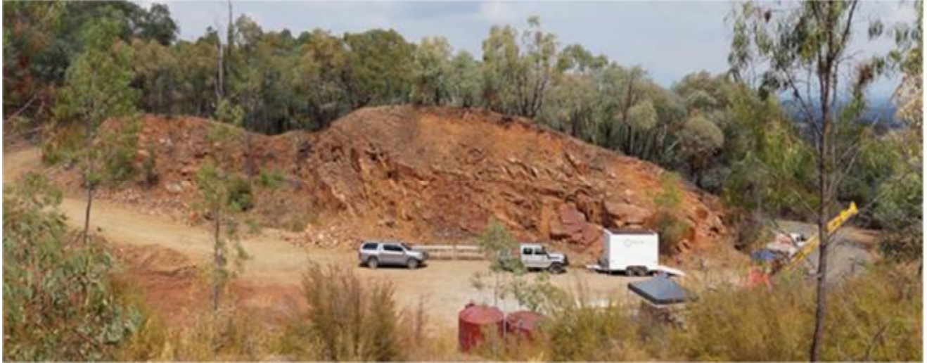
Figure 2 Diamond drilling at the Everton porphyry molybdenite cupola