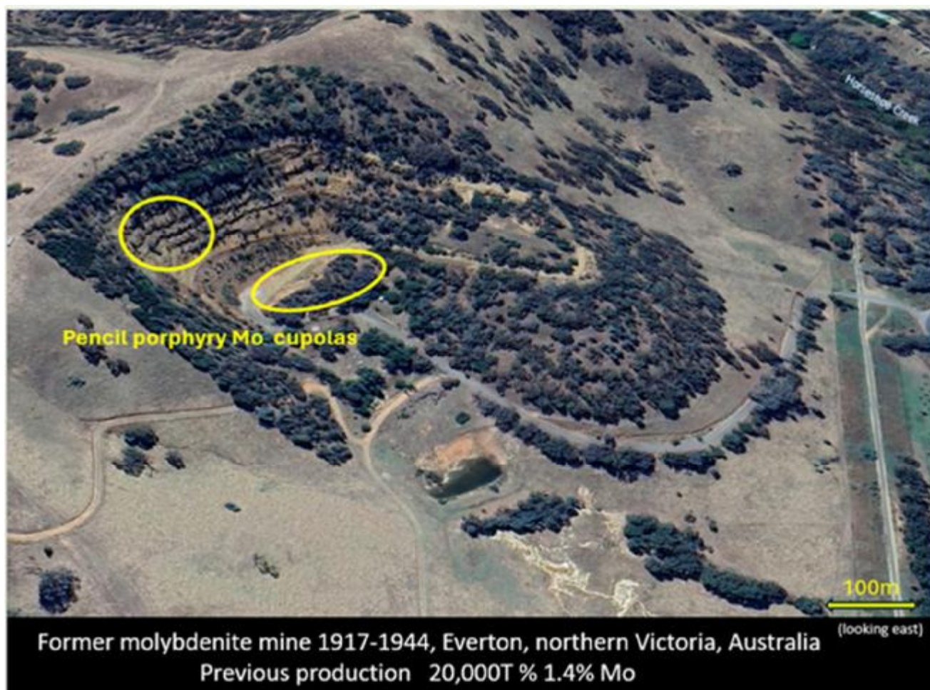
Figure 1 Outcropping molybdenite-bearing pencil porphyries, Everton, Victoria